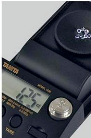
Jewellery Weighing gold, silver, precious stones