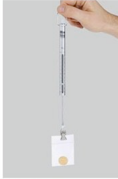
Numismatics Coin scale