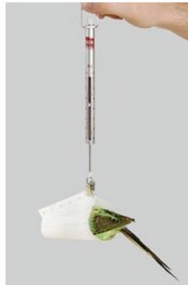
Animal research e.g. ornithology Weight fluctuations and growth control