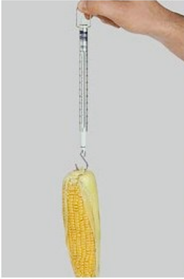
Agriculture Fertilizer dosage, evaluation of harvesting time, control of yield