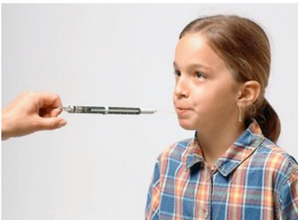
Logopedia Measuring lip closing forces