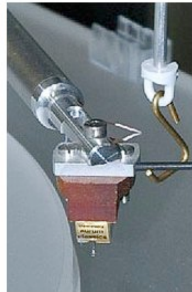
High-End turn tables Determine the bearing force of pick-ups