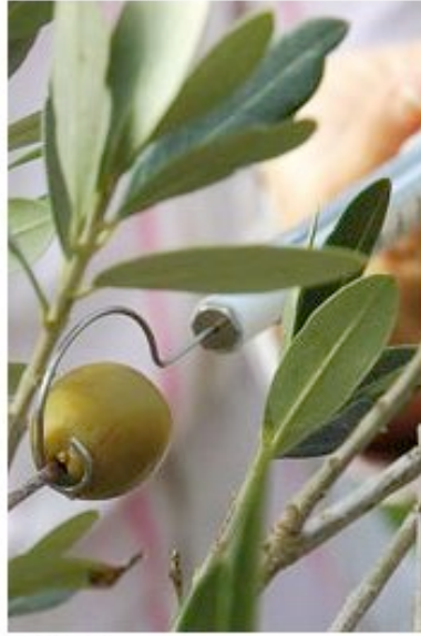
Agriculture evaluation of harvest timing e.g. resistance of olives when picking